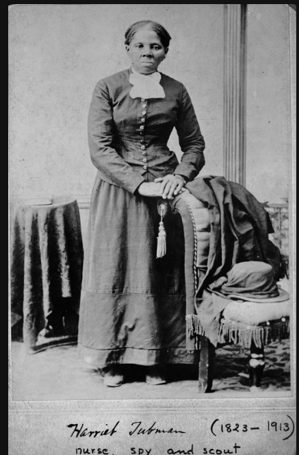
Harriet Tubman (1823-1913) nurse, spy and scout

Harriet Tubman was an American abolitionist and political activist. She was an escaped enslaved woman and later was a leader of the Underground Railroad. This railroad led enslaved people to freedom before the Civil War.